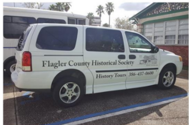
The History Shuttle has been making regular runs!